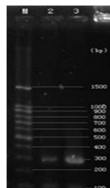
Figure 2. PCR analysis of aph(3'')-III in L. pentosus strains Ind-3 and P. With primer of aph(3'')-III, the PCR amplifications were conducted with the plasmid template in strains Ind-3 and P. The PCR amplicons were separated by 0.7% (w/v) agarose gel electrophoresis (100V, 4°C). Lane M: reference standard marker (100 bp - 1500 bp); Lane 2: aph(3'')-III amplicon of strain Ind-3; Lane 3: aph(3'')-III amplicon of strain P.

and Ind-3 (Table 2). As shown in Figure 2, one band about 292 bp was shown in PCR products of strains Ind-3 and P, respectively.