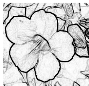
Figure 2. Characteristic of Thunbergia laurifolia flower in Thailand

For more than 30 years, preclinical and clinical researches have been investigated to prove anti-inflammatory effects in T. laurifolia leaves (Chuthaputti, 2010). The anti-inflammatory efficiency dose of the aqueous leaves extract of T. laurifolia (2.5 g/kg) has been reported to be two-fold higher than that of Garcinia mangostanarind rind extract (5.5 g/kg) with carrageenan induced paw edema model in mice (Pongphasuk et al. , 2005). Moreover, Wonkchalee et al. (2012) reported that T. laurifolia possessed anti-inflammatory and antioxidant properties which improved liver function in hamsters treated with liver fluke infection or after administration of N-nitrosodimethylamine (NDMA, a potent hepatotoxin, carcinogen and mutagen). The research found that fresh and dried aqueous