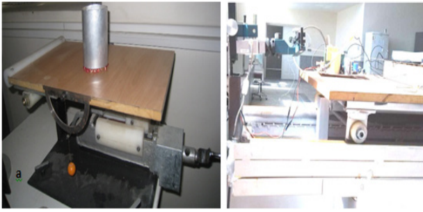
Figure 1. Apparatus for measuring static coefficient of friction (a) dynamic coefficient of friction (b)

center of a circular plate with diameter of 350 mm. It was filled with the samples until a cone formed on the circular plate. The diameter (D) and height (H) of the cone were recorded. The filling angle of repose was calculated using the following formula (Mohsenin, 1986):